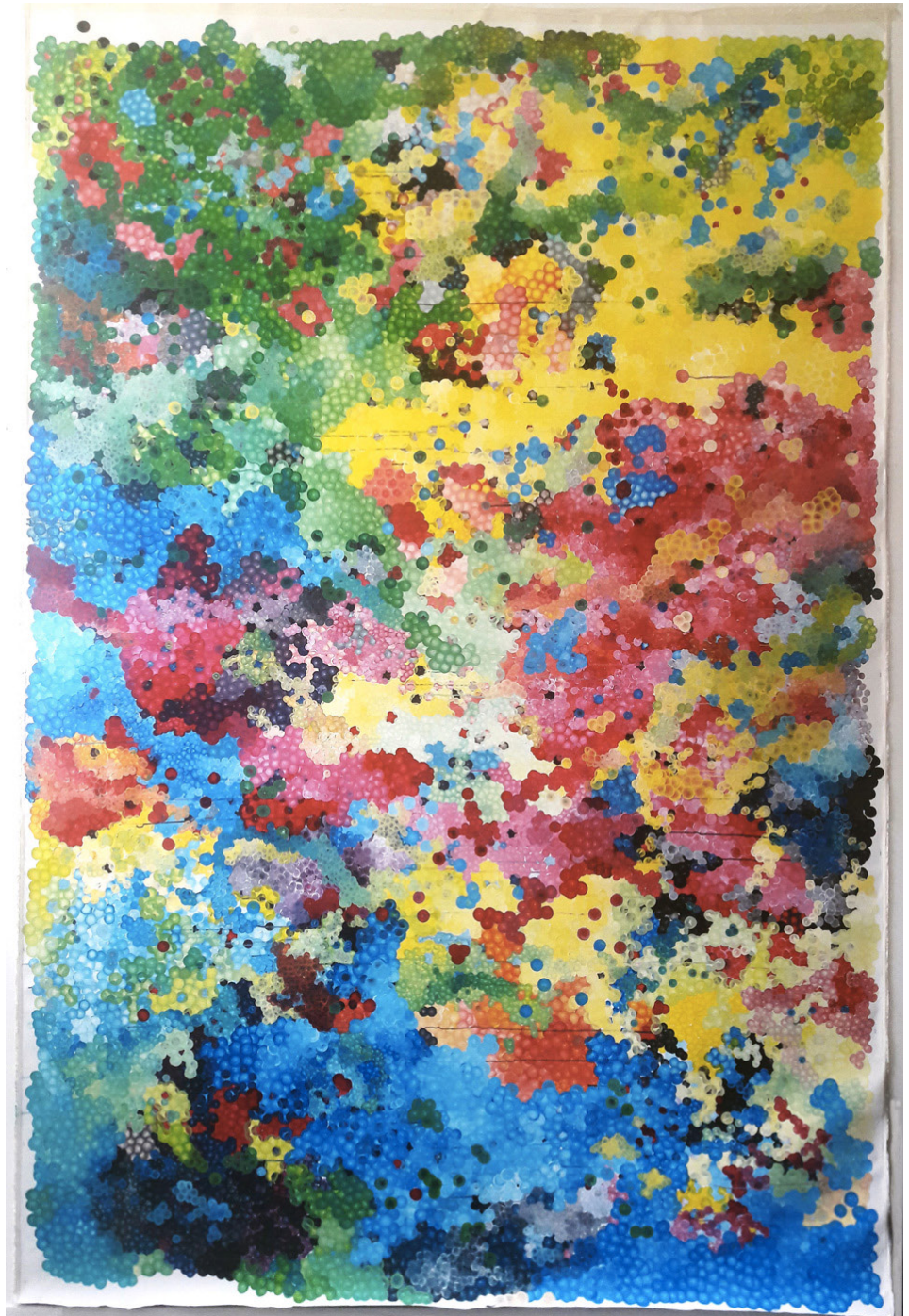
Anne-Flore Cabanis, Mouvements , 2019 Acrylic on canvas, 300 x 200 cm

The use of images is exclusively reserved for the promotion of the exhibition and valid up to its end. Obligatory mention: © Anne-Flore Cabanis, Courtesy Galerie Esther Woerdehoff