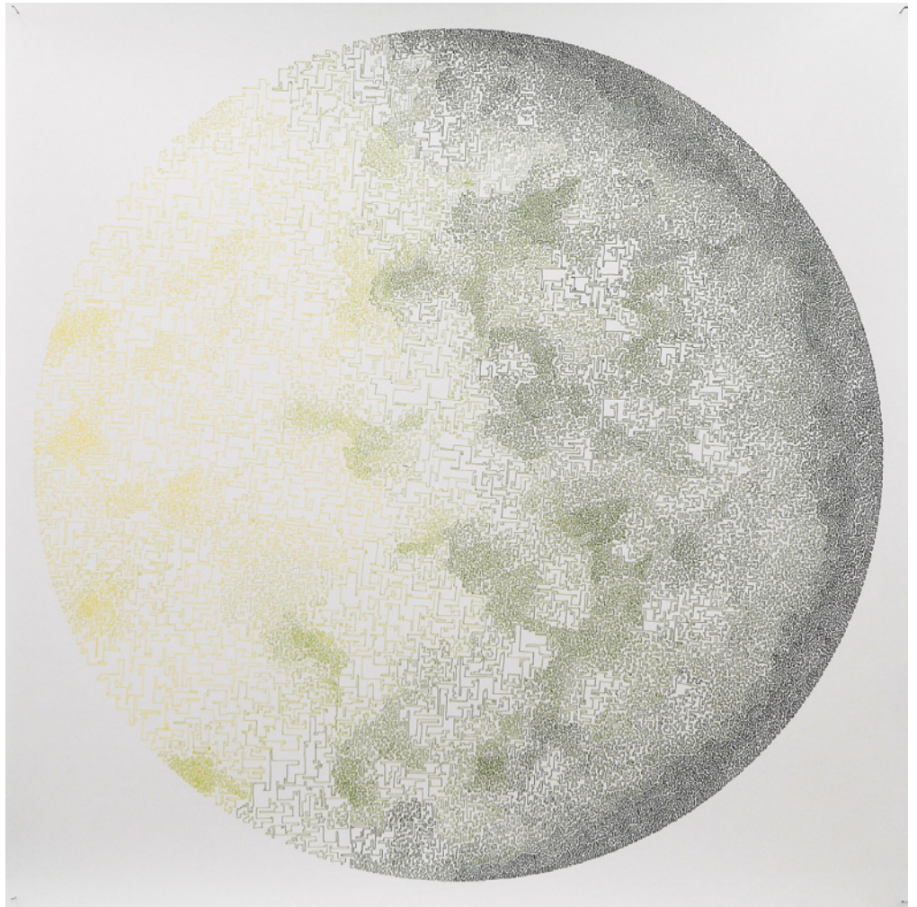
Anne-Flore Cabanis, Jaune à vert , 2013 Coloured inks on paper, one line, 75 x 75 cm

The use of images is exclusively reserved for the promotion of the exhibition and valid up to its end. Obligatory mention: © Anne-Flore Cabanis, Courtesy Galerie Esther Woerdehoff